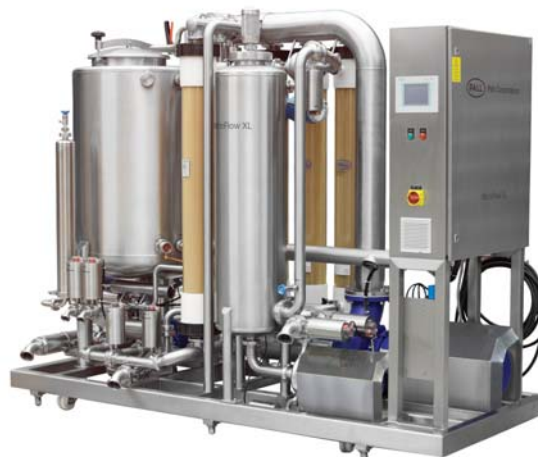
Pall Microflow XL-Brine Crossflow Microfiltration System